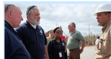
Figure 3: Partnership Approach

In addition, the timing seemed right for developing such an approach. The EPA spoke with and obtained support from government stakeholders in earthquake resilience, including our federal partners including the U.S. Geological Survey (USGS) as well as state partners representing water primacy agencies, state geological agencies and state hazard mitigation officers. The EPA's efforts were consistent with other associated federal activities, notably the Federal Earthquake Risk Management Standard that governs federal facilities. Also, over the last several years, certain water and wastewater utilities have established best practices for earthquake resilience, although the dissemination of this information was somewhat limited. When the EPA reached out to small utilities located in earthquake vulnerable areas (Figure 3), there was generally an enthusiastic response for the EPA to provide technical assistance and tools for earthquake resilience. This sentiment was best represented by a small water utility in western Tennessee that said that the EPA's earthquake resilience guidance