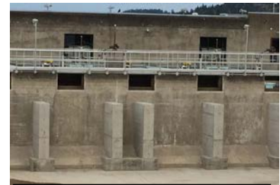
Figure 2: Mitigation for Basin

The U.S. Environmental Protection Agency (EPA) wants vulnerable utilities to be aware of this earthquake hazard and the potentially devastating impacts to public health and the environment. EPA's Office of Water has a mission to help water and wastewater utilities prepare for, mitigate, respond to and recover from various hazards, including earthquakes. If water and wastewater utilities understand the threat of earthquakes and the potential impacts to both their infrastructure and the community, utility owners and operators can make more informed decisions regarding earthquake mitigation options (Figure 2). While requiring financial investment, earthquake resilience and mitigation projects can significantly reduce or even prevent much costlier damages and economic impacts from future earthquakes. Also, the faster a water or wastewater utility recovers from an earthquake, the faster the community it serves can recover. Because of the factors above, the EPA began to consider developing a national approach to share seismic awareness, hazard assessment and mitigation practices with a larger universe of water and wastewater utilities.