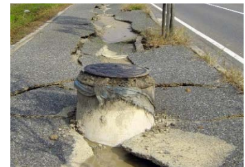
Figure 7: Manhole Floats from Liquefaction