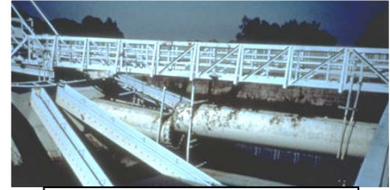
Figure 1: Damaged Clarifier

More than 143 million Americans, almost half the population of the United States, live in areas that are vulnerable to earthquakes. The West Coast is particularly susceptible, but earthquakes can happen almost anywhere. For example, in the Central United States, the New Madrid Seismic Zone is a significant threat to eight states. For a community, water and wastewater utilities are critical lifelines and with tens of thousands of them located across the country, many are in earthquake hazard areas. Water and wastewater utilities are particularly vulnerable to earthquakes due to their extensive networks of above and below ground pipelines, as well as other facility assets like pumps, tanks, administrative and laboratory buildings and reservoirs (Figure 1).