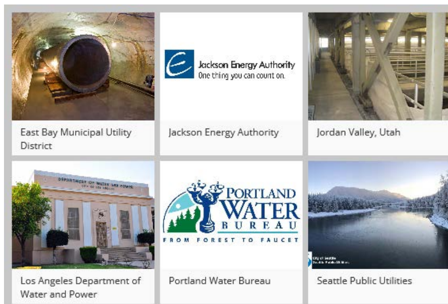
Figure 11: Utilities Examples - shared experiences in mitigating impacts to earthquakes

several water utilities that have implemented measures to become more resilient to earthquakes (Figure 11).