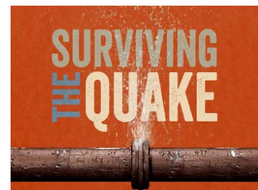
Figure 4: Awareness Video

the video points to the other EPA tools including the Earthquake Resilience Guide and Earthquake Interactive Maps.