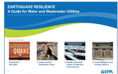
Figure 6: Homepage of Guide

Small and medium utilities, especially those in lesser known earthquake hazard areas like the New Madrid Seismic Zone, will benefit from the information in this Guide. However, the Guide cautions water utilities about proposing major seismic upgrades based solely on this information - a more detailed on-site analysis is recommended.