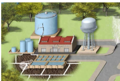
Figure 5: Animated Utility

This animated video, Surviving the Quake (Figure 4), is an awareness video targeted to utilities, but can also be useful for city or town managers and funding agencies. The video shows the types of